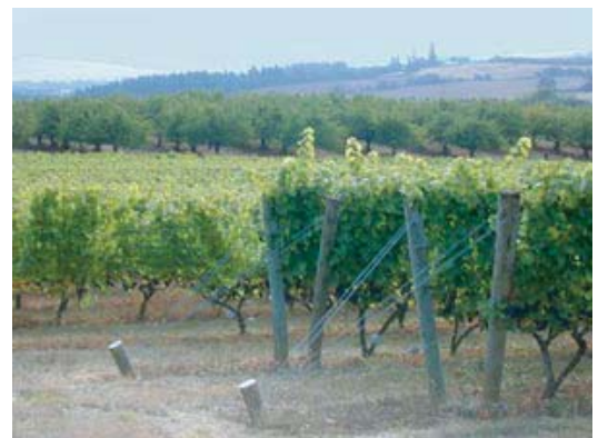
Lyre trellised vines at Freedom Hill