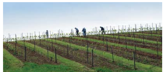
Young vines at Shea Vineyard